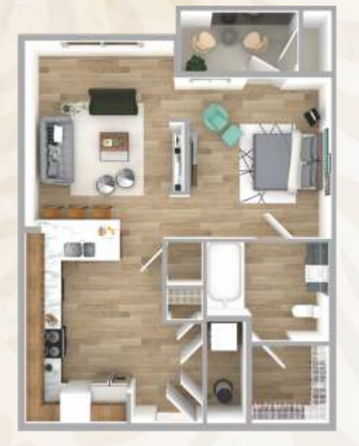
1 Bath 602 Sq. Ft.*