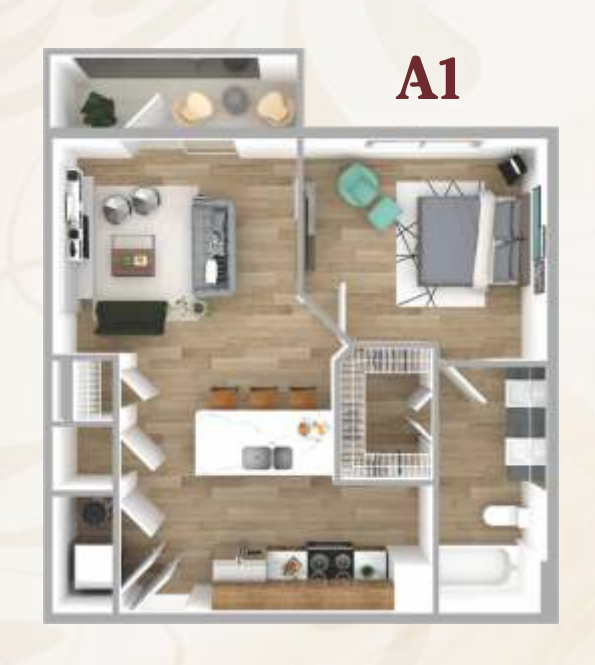
1 Bedroom / 1 Bath 650 Sq. Ft.*