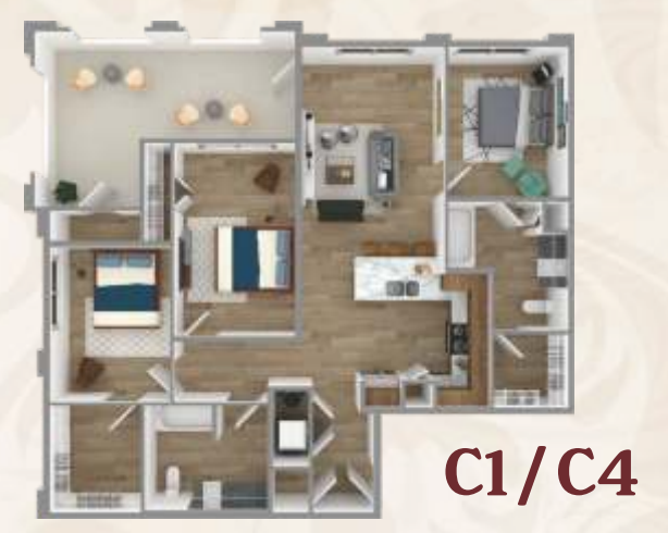
3 Bedroom / 2 Bath 1,156 / 1,199 Sq. Ft.*

*Square footage is approximate Actual floorplans may vary