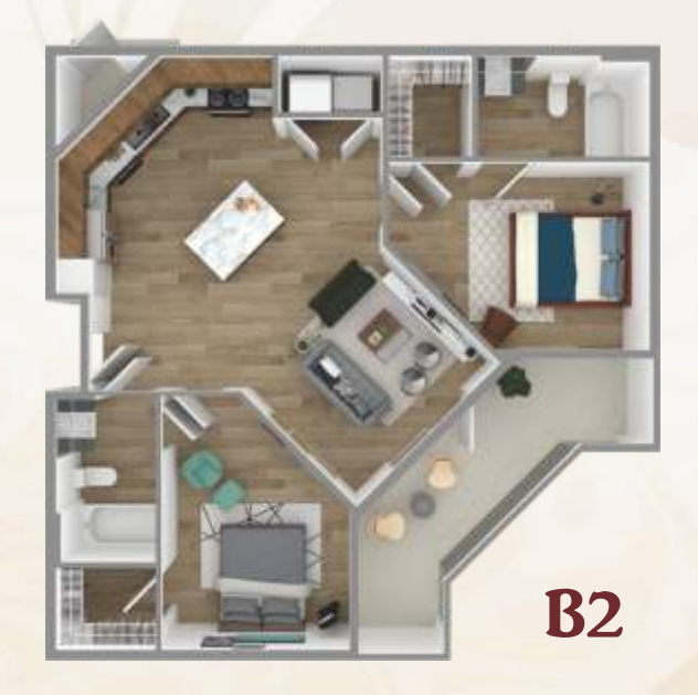
2 Bedroom / 2 Bath 850 Sq. Ft.*

*Square footage is approximate Actual floorplans may vary