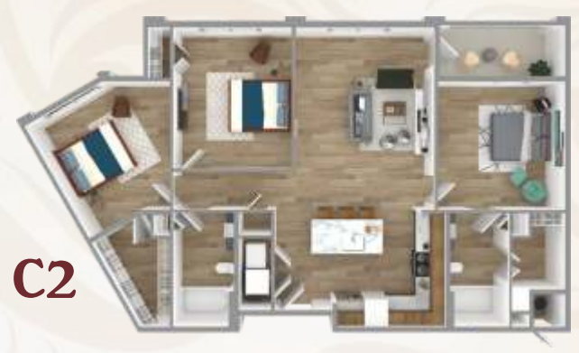
3 Bedroom / 2 Bath 1,220 Sq. Ft.*