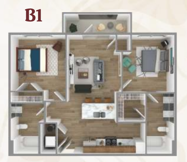
2 Bedroom / 2 Bath 850 Sq. Ft.*