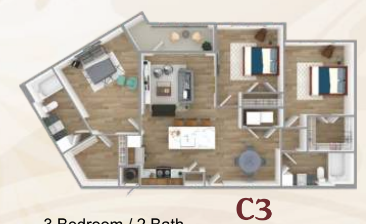
3 Bedroom / 2 Bath 1,274 Sq. Ft.*